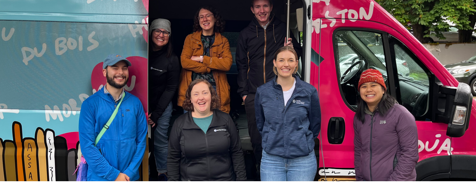
City Light and SDOT staff celebrate the launch of an ADA-accessible electric vanshare program hosted by Estelita's Library.