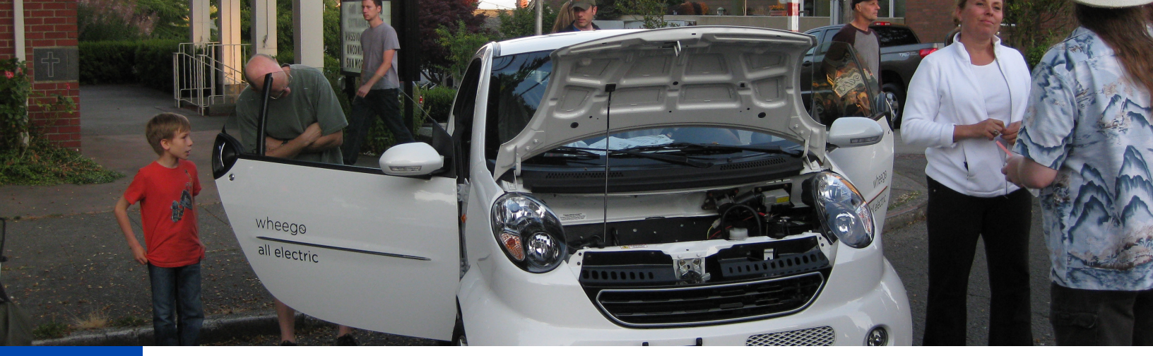
Neighbors explore an electric car at a public event in Greenwood.