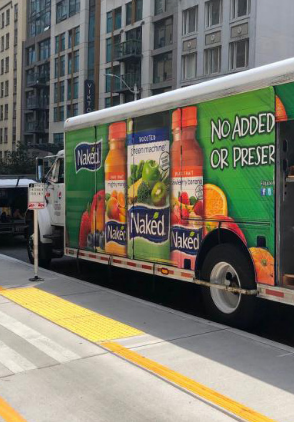
A goods delivery truck parked at a curb loading zone.