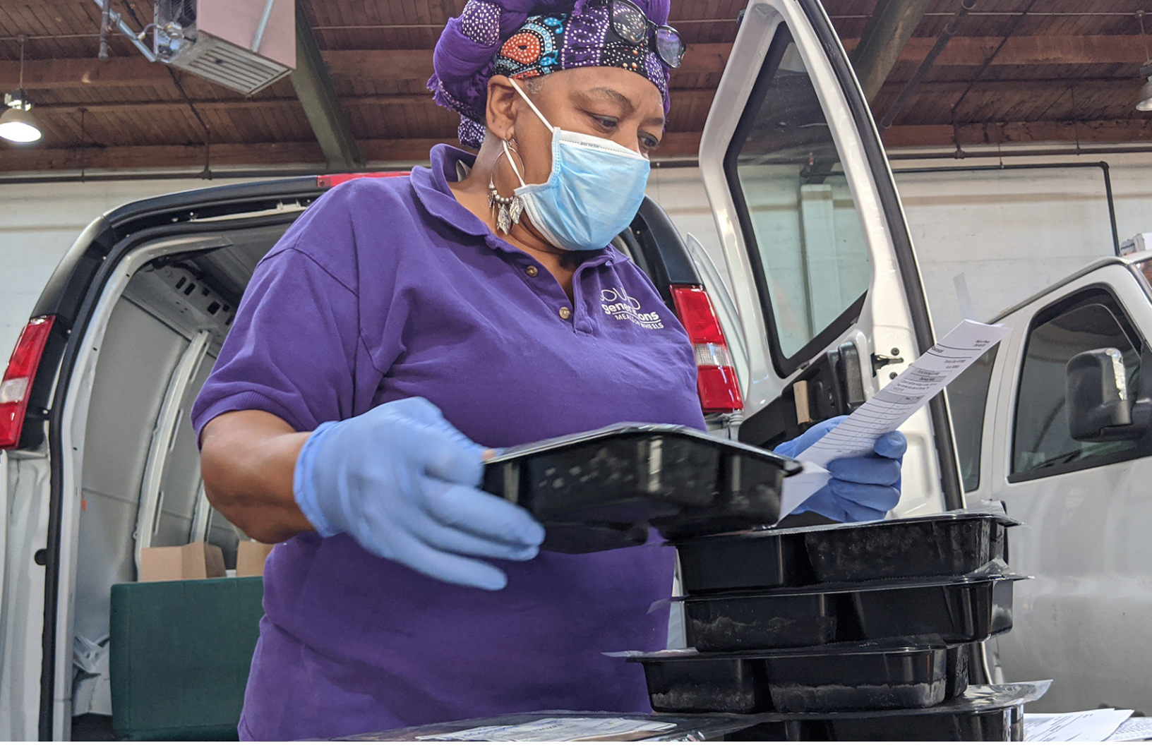
A woman unloads trays from an electric van at Sound Generations.