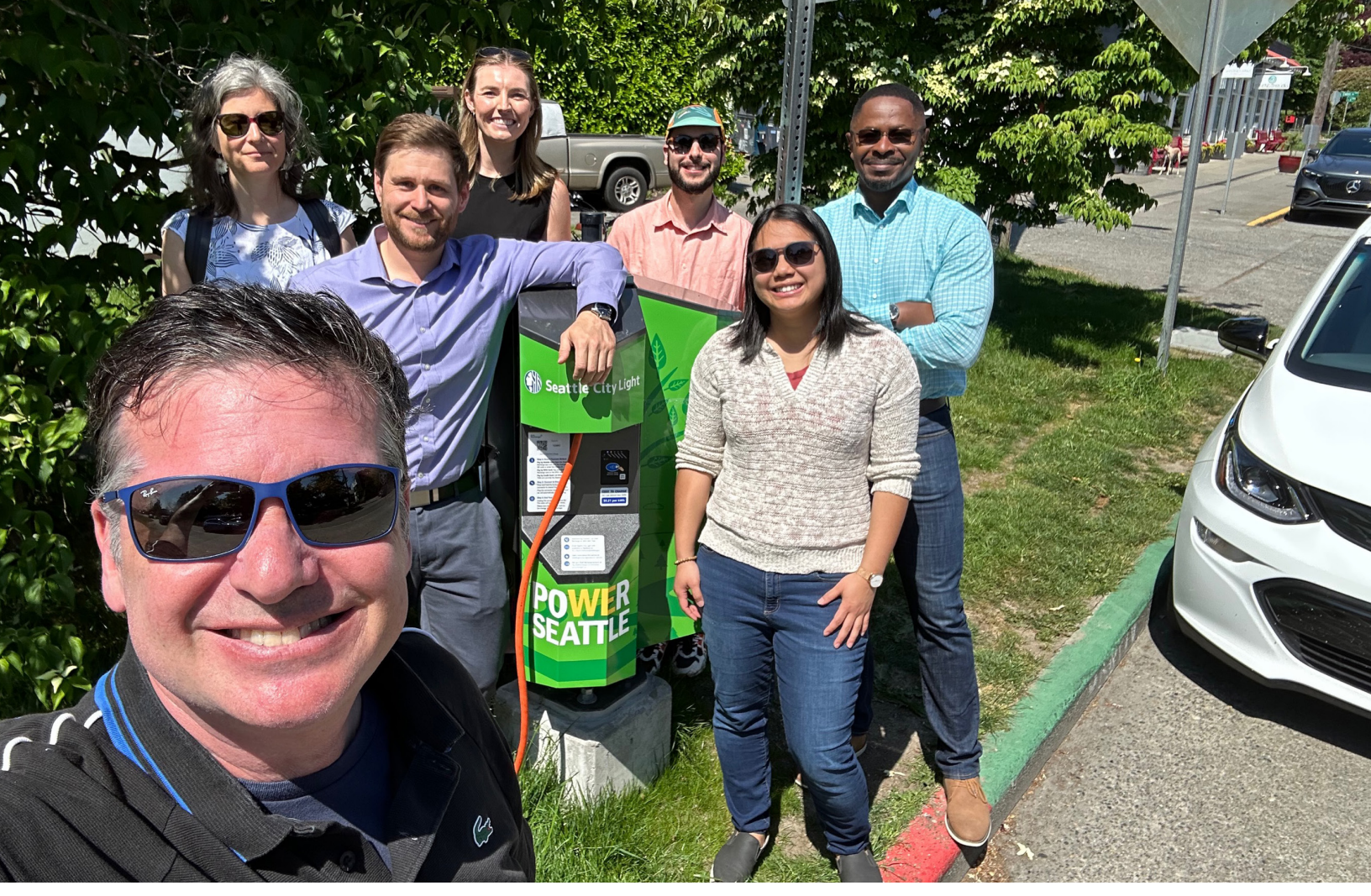
SDOT and City Light staff at a Curbside Level 2 EV charging station.