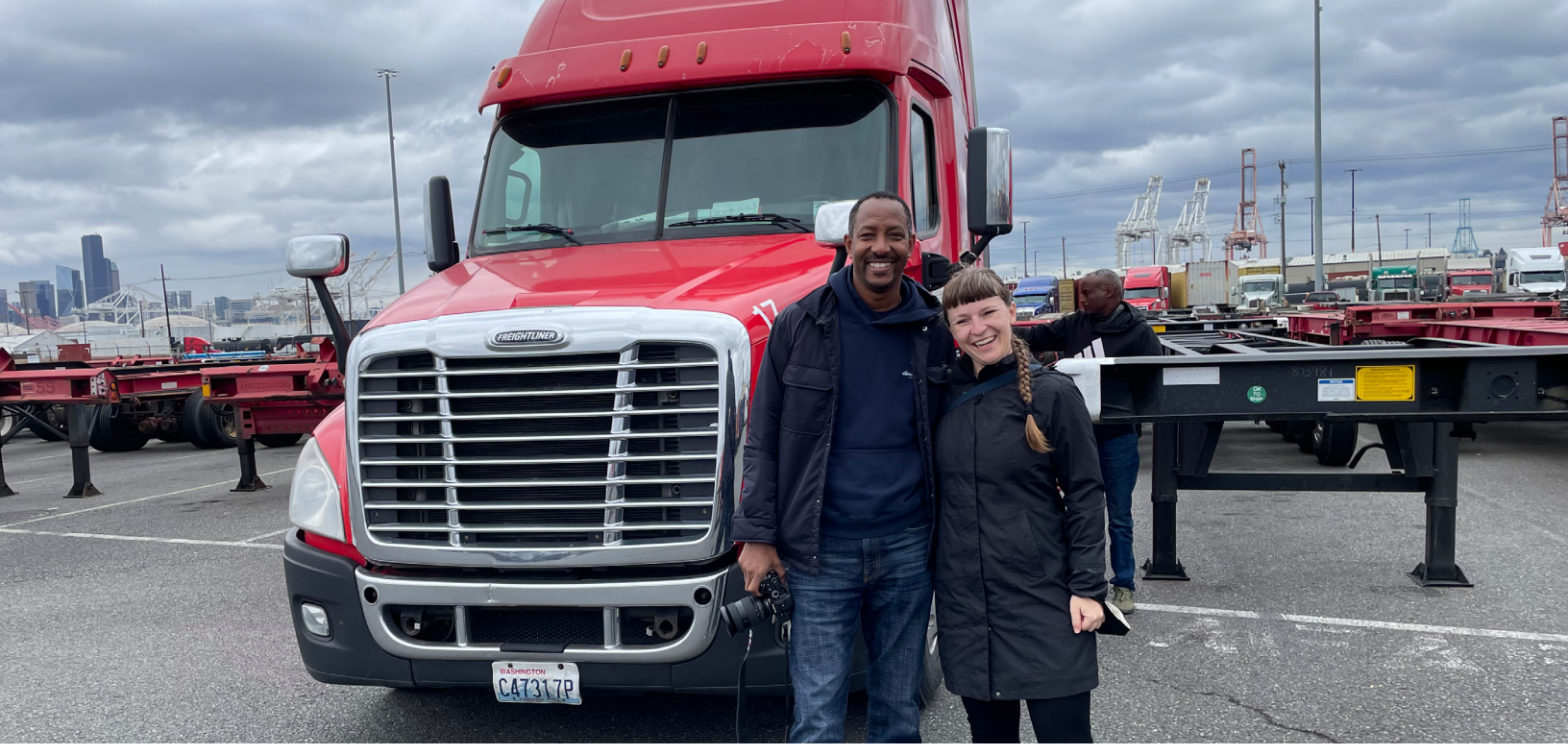
Visitors inspect a vehicle participating in the Heavy Duty Vehicle Electrification Incentive Pilot.