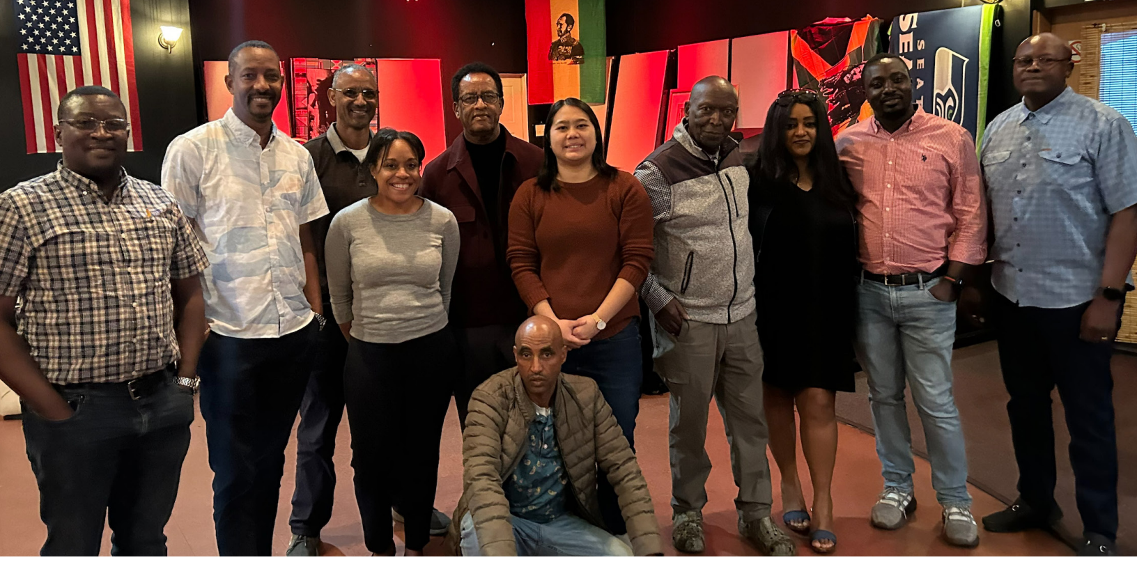
OSE and City Light staff attend a driver advisory committee meeting to support the Heavy Duty Vehicle Electrification Incentive Pilot.