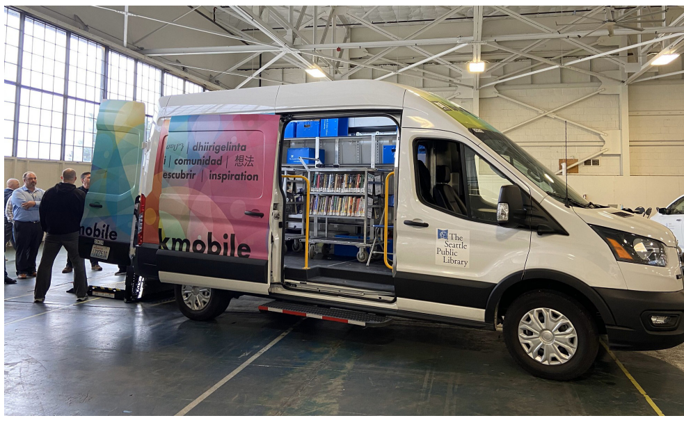
Seattle Public Library vehicle featured at the first Citywide Electric Vehicle & Equipment Showcase Expo at Magnuson Park.

As part of this effort, SDOT in collaboration with FAS and union partners has 4-6 fleet transition pilots active in 2023 and 2024. This year, the first citywide Electric Vehicles & Equipment Showcase Expo promoted cross-department knowledge sharing. Demonstrations and pilots have included testing an EV sweeper for protected bike lanes, deploying all-electric forklifts and rollers, deploying rented or borrowed EVs in partnership with vendors to assess their real-world service delivery performance and testing drop-in renewable diesel in city vehicles as a more environmentally-friendly alternative to conventional fossil fuels.