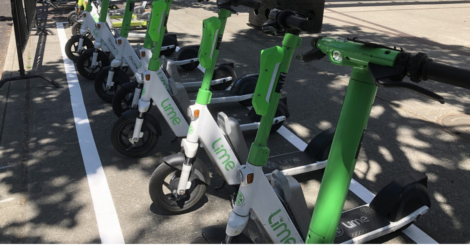
A row of parked Lime shared electric scooters.